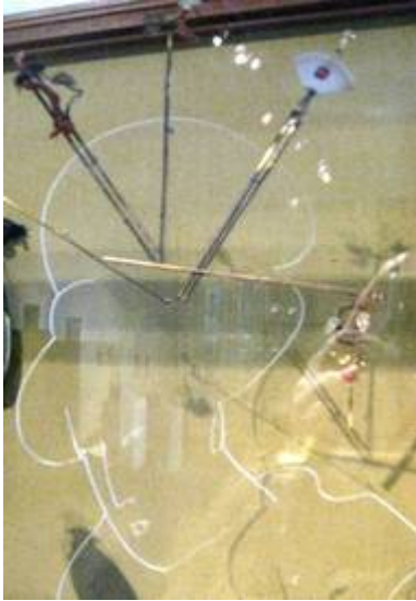
Several examples of Japanese hairpins in steel, bone & other materials from the early Meiji period (1868 – 1912. (Courtesy Museum of Applied Art, Copenhagen) www.kunstindustrimuseet.dk/

These 'hairpins' (believed to be the original application) were found in Rhineland graves (circa 600 AD) when Frankish (Western Germany) rule and culture were dominant. A high proportion of assimilated Romans were living in this area at that time and the finds were buried with members of,