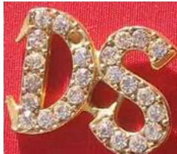
A diamante (paste) hatpin (on a red background) from the mid 1980s with one missing stone is about 1.125" wide and 0.87" high. These were also made in blue/sapphire and red/ruby diamante.