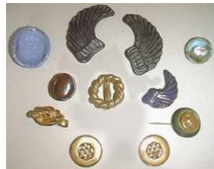
Ceramic hatpin heads (with one complete with pin) designed by Lucie Rie, a well known ceramics designer, for Orplid

World War I had, of course, a significant effect on all aspects of life in those countries directly involved. Fashions changed dramatically resulting in much smaller hats requiring shorter hatpins. Hatpins with buttons from the services were popular with wives and sweethearts as well as a