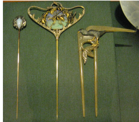
From left to right. Rene Lalique (1860 to 1945) From L to R: - hatpin; Brystsmyske (corsage pin); Hair adornment - all from about 1898 to 1899 (Exhibit at the Danish Museum of Decorative Art)

There are a variety of hatpin holders in private collections and for sale in antique shops and auctions. More surprisingly, Wedgwood Museum at Barlaston, was making hatpin holders in 2009 as part of their pottery demonstration and these were on sale in their Museum shop see www.wedgwoodmuseum.org.uk/home