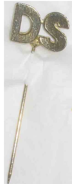
This plain (on a white background) late 1970s hatpin head is circa 1.4" wide and 0.87" high. Pin length is about 4"

Post WW II fashions took off in the late 1940s with the New Look and many new materials were developed and incorporated in consumer and commercial goods. An example of new millinery trends included David Schilling hats and hatpins