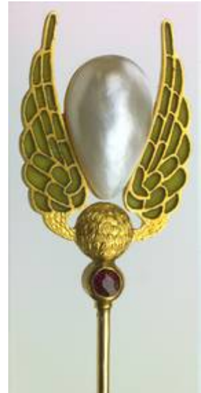
Double-sided hatpin, Vienna Secession with pearl ,gold plique-à-jour enamelled 'wings', ruby on one side and sapphire on the other side. H: 18 cm (7.09") W: 2.1 cm (0.83"). Marks: Vienna poinçon (hallmark) & indistinct maker's mark Austrian, c.1900. In fitted case. Ref: 4731

I hope that this article will bring to light more evidence of hatpins prior to 1888 as the following examples of useful sources of information relating to the existence of early hatpins have yet to be investigated:-