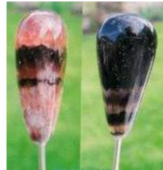
The Autumn 2006 meeting of the HPSGB was held in Buxton and many members visited the blue John Cavern where the mineral has been formed over thousands of years by water action on limestone.

Hatpins have by no means died out in the 21st century and examples of are being offered by the big name milliners as well as being available from a variety of other sources but with relatively short pins.