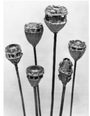
'Frankish hairpins' circa 7 th century

The Egtved Girl's grave (not illustrated) is one of Copenhagen's National Museum's most famous exhibits. She was 16 to 18 years old, around 5' 3" (160 cm) tall, slender with fair, rather short hair and buried in the summer of 1370BC. Her oak coffin included bones, some teeth, nails and a little skin. She wore a short blouse and a cord skirt to the knees and some metal and horn artefacts