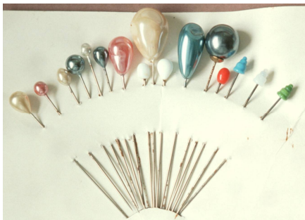
Some examples of glass 3" & 4" long hatpins made and marketed by The English Glass Co. Ltd. from 1939 to circa 1955.

There are a variety of hatpin holders in private collections and for sale in antique shops and auctions. More surprisingly, Wedgwood Museum at Barlaston, was making hatpin holders in 2009 as part of their pottery demonstration and these were on sale in their Museum shop see www.wedgwoodmuseum.org.uk/home