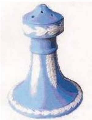
From the autumn 2005 issue of the HPSGB Newsletter. "So here we are 25 years on. ....we have produced another Hat Pin Holder to commemorate our achievement of promoting Hat Pins throughout the world.

The Hat Pin Society of Great Britain was launched in 1980 and as part of its 25 year celebration it commissioned a Wedgwood hatpin holder as well as hatpins in 2006 from Blue John Cavern – both for purchase by members. Blue John was a popular material for hatpin heads in the 20 th century. The Society had also commissioned Jet hatpins too.