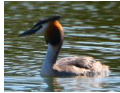
A great crested Grebe.

Collecting attractive late 19 th and early 20 th century hatpins is a rewarding hobby for many, but researching the evolution of the hatpin can provide infinite appeal and interest and, unlike buying the best hatpins, is relatively free of cost if not of time. With Darwin's recent bicentenary, (d.o.b. 12/2/1809) one can be forgiven for wondering whether part of his theory of evolution can also be applied to inanimate objects such as the relatively modern dress accessory - the hatpin - which appears to be the result of a happy series of need and coincidences with its ancestry in the Stone Age or, maybe, even earlier!