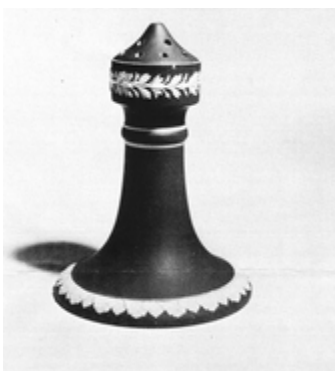
Dark blue, 6" high, Wedgwood Jasper Hatpin holder with 13 holes in top from circa 1900. Cat. No. 4044. F III 7.